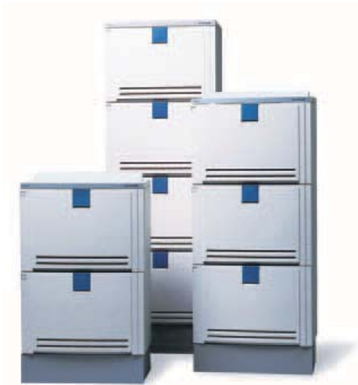
MD110 may be built with one to four stackable modules, placed side-by-side or back-to-back.