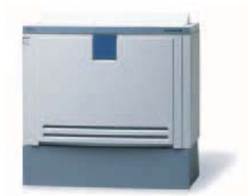
MD110 is prepackaged for small to medium-sized companies and branch offices.