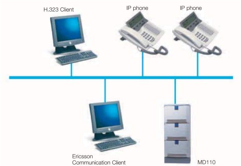
IP Telephony in the Office