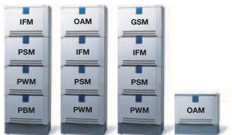
The illustration shows an example of how the stackable modules can be arranged for a 3-LIM exchange.