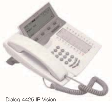
Dialog 4425 IP Vision

The main scenarios foreseen are home working/remote working and small to medium sized branch offices with up to 100 users.