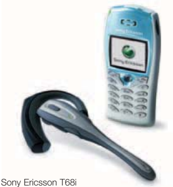
Sony Ericsson T68i